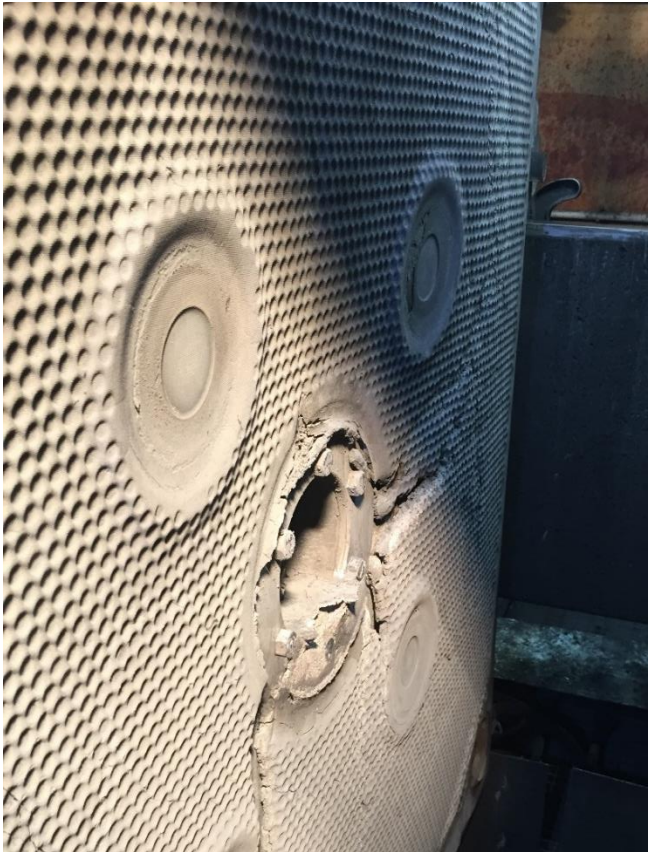
Illus. 21: Gap washing; too high flow rate causes washing channels in the filter cake